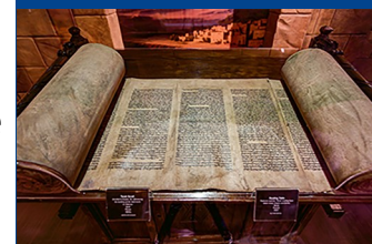
Enjoy the Bible Scroll Exhibit at the Ark Encounter