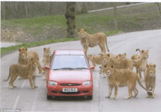
Hope they have already eaten!