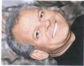
Dr. Johnny M. Hunt August 10, 2011 7:00 p.m.